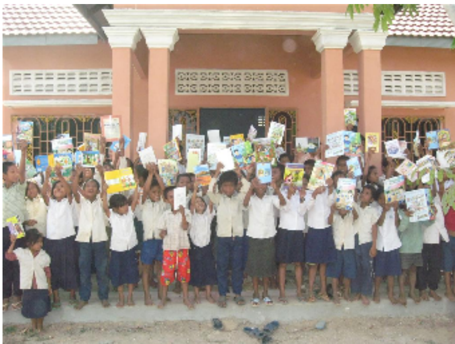
The children love their new library filled with books!