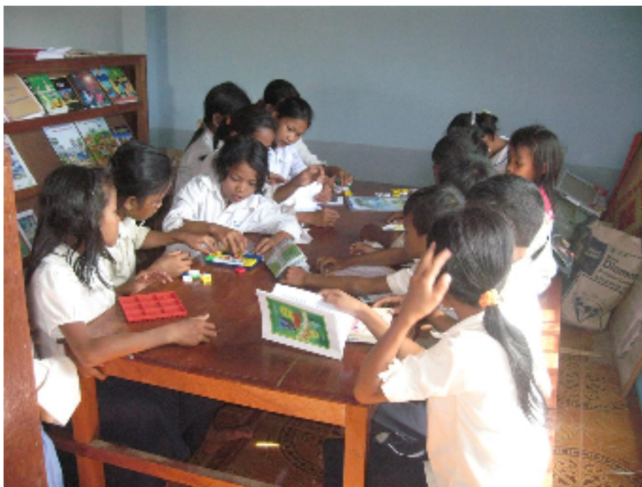
The children are reading and playing with educational games in the new library