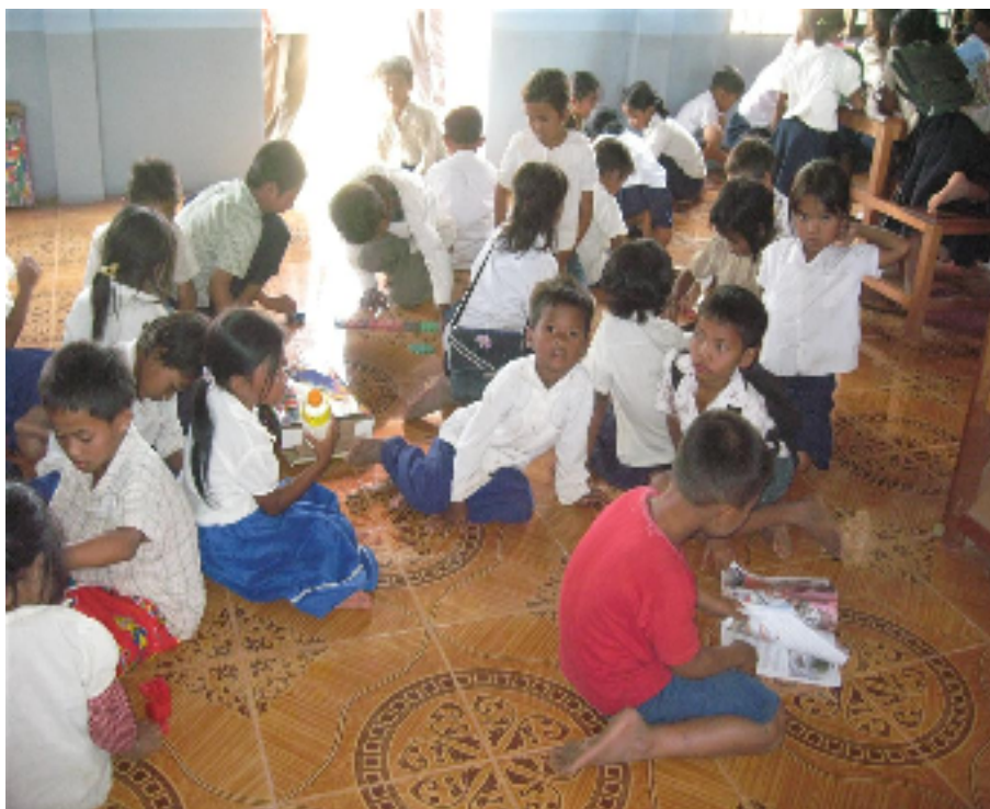
The children love playing with the puzzles