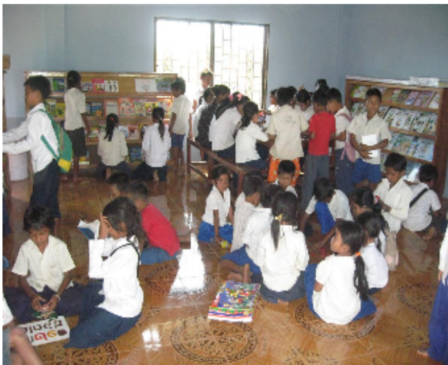
So many children use the library that they fill the tables and the floor