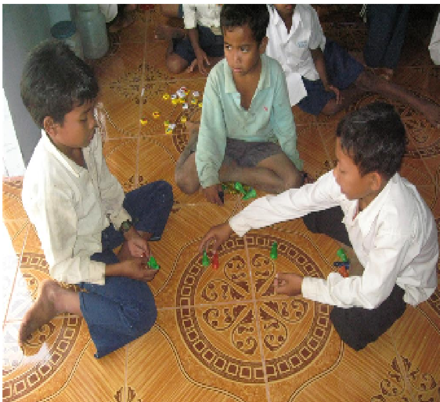
These children are playing a game they call "Study"