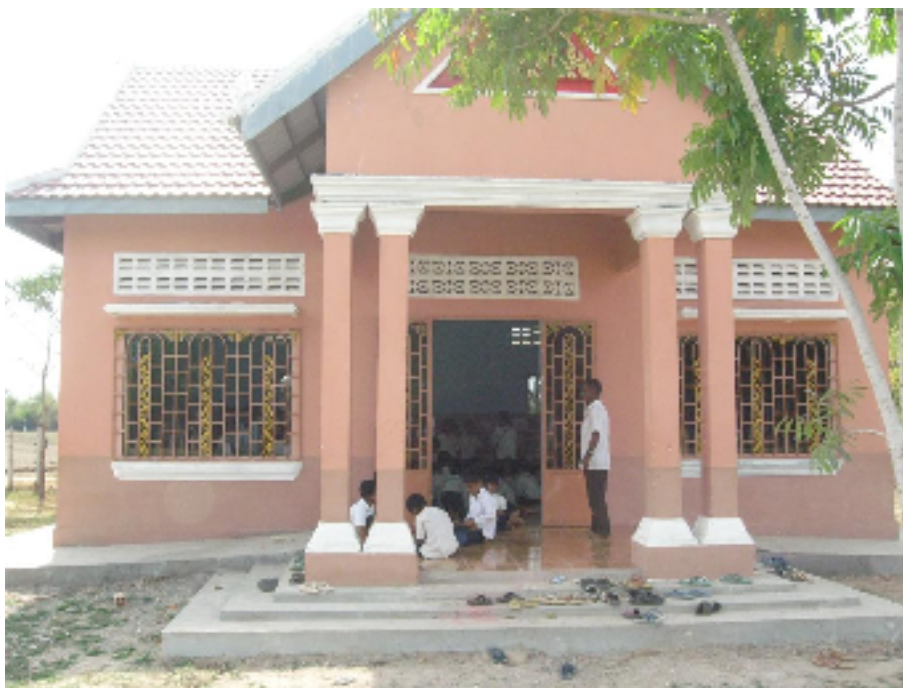
The Constructed Reading Room