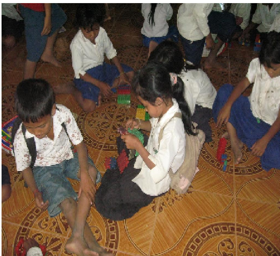
The children concentrate to solve the puzzles