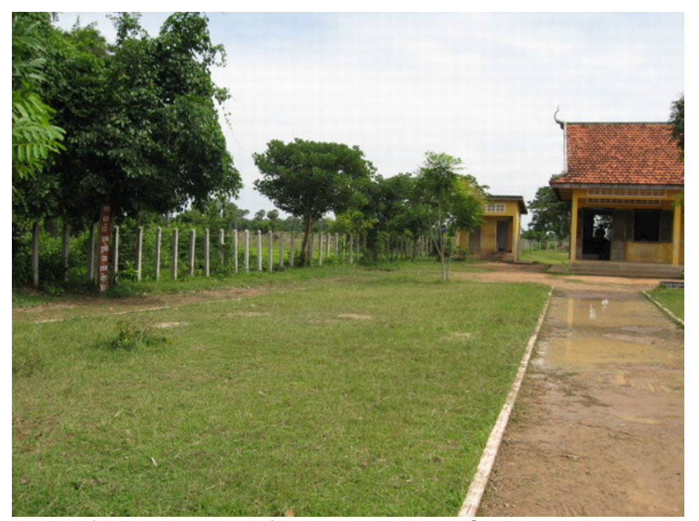
A view of the land set aside for the proposed new Constructed Reading Room